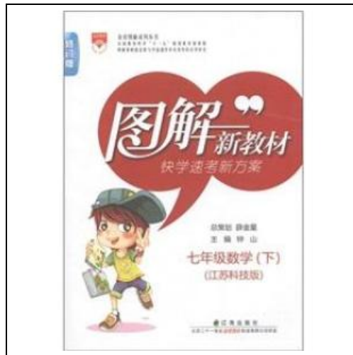
Diagram of the new materials: 7th grade math (Vol.2) (Jiangsu Science and Technology Edition) (Revised)(Chinese Edition)